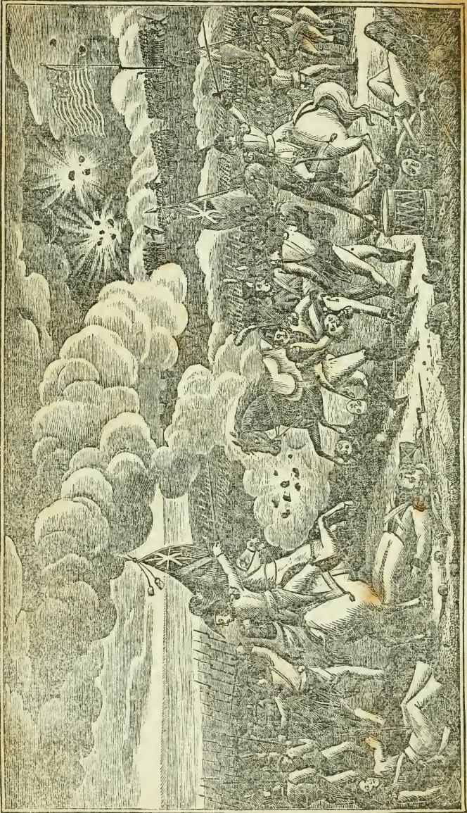
BATTLE OF NEW ORLEANS.....GENERAL JACKSON.